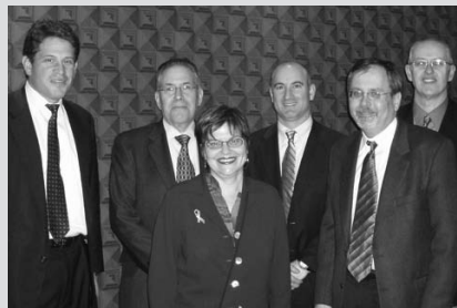
Panelists and moderator of afternoon session on “Residential Issues”