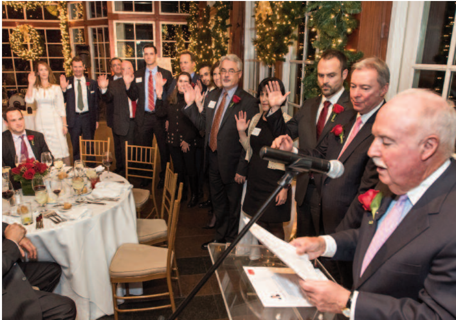
2016 Board being sworn in