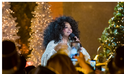
It was a real treat to have Diana Ross singing right outside on the ice rink as our backdrop.