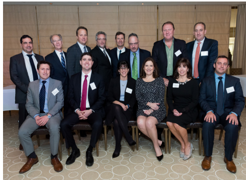
2019 Board of Directors